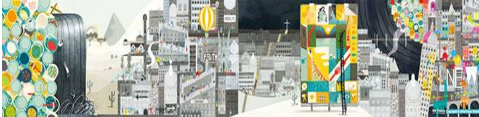
The Understanding Christianity frieze

In this document, text in green indicates where there are links to Understanding Christianity. Schools which have received the training should follow these links rather than creating extra units of work.